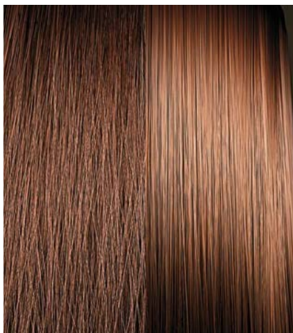
FROM LEFT: Before and after photos show dramatic improvements in smoothness, shine and health with Baobab Heal & Repair.*